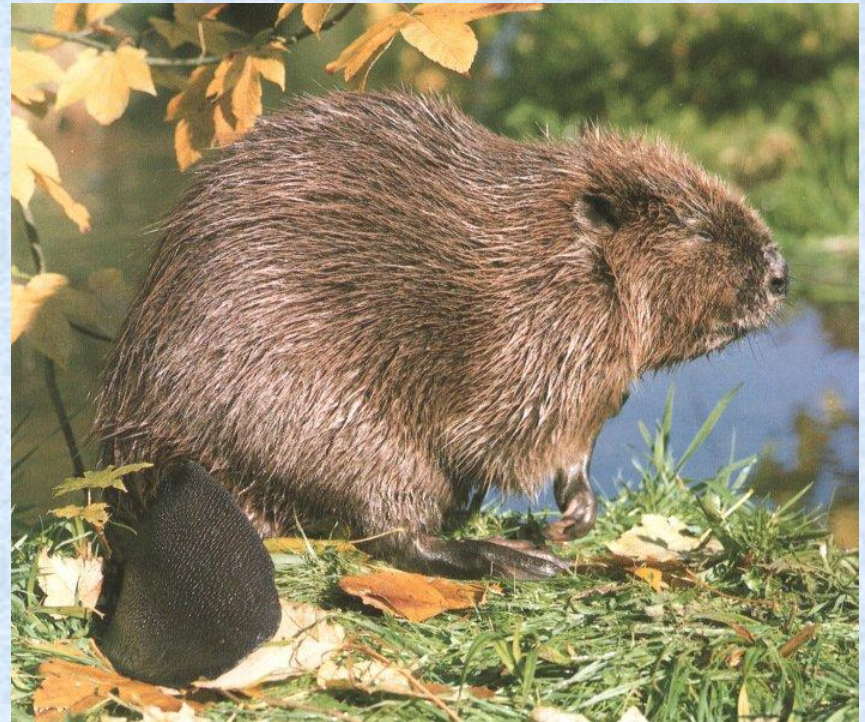
The American Beaver

The colonists started having problems with the French trappers.